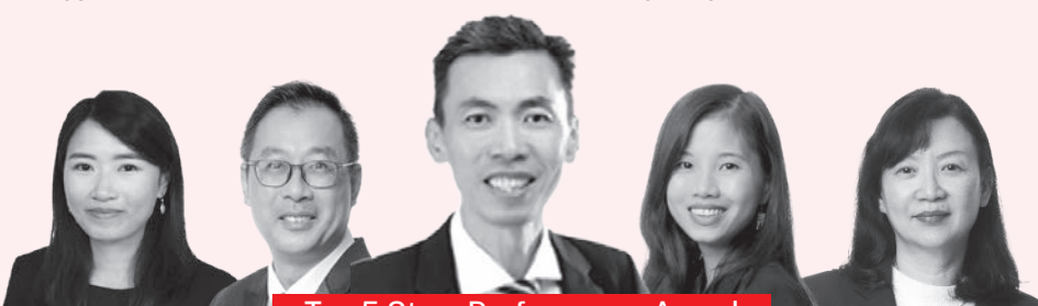
Top 5 Stars Performance Award